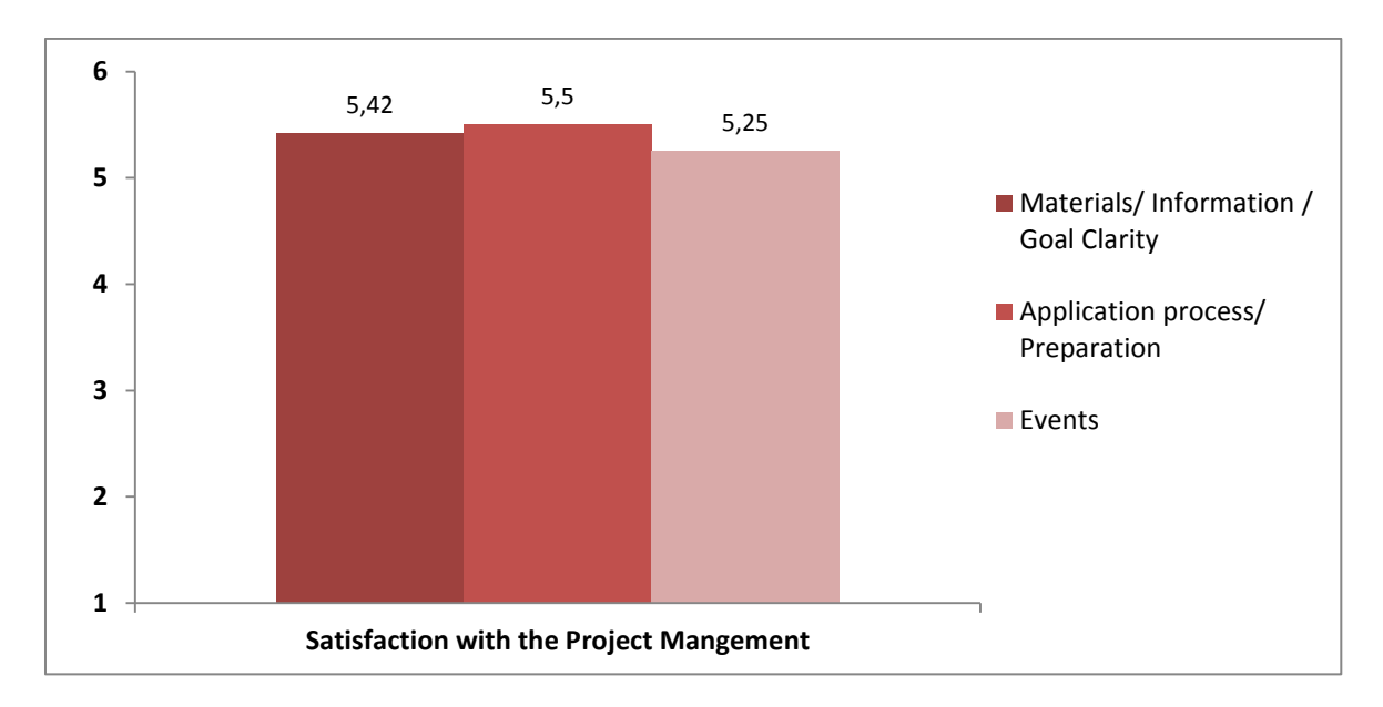
Figure 3. Satisfaction of the academic Mentors with the Project Management. Mean Values are displayed (Answer options: 1 [strongly disagree], 2 [disagree], 3 [somewhat disagree], 4 [somewhat agree], 5 [agree], 6 [strongly agree]).